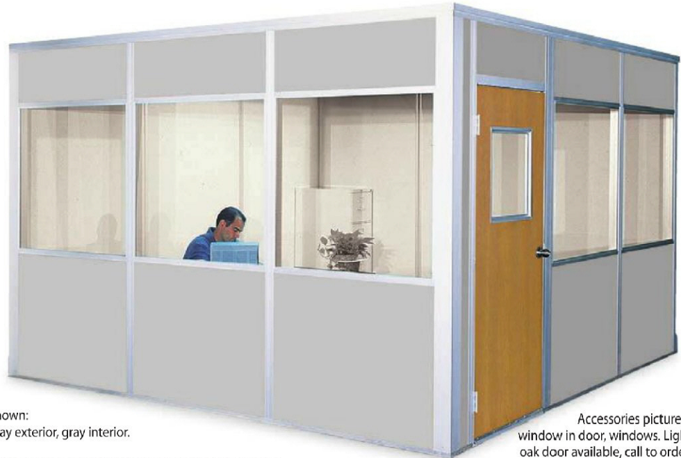
Shown: gray exterior, gray interior.

Fire retardant drywall construction available on all buildings. Please call for quote.